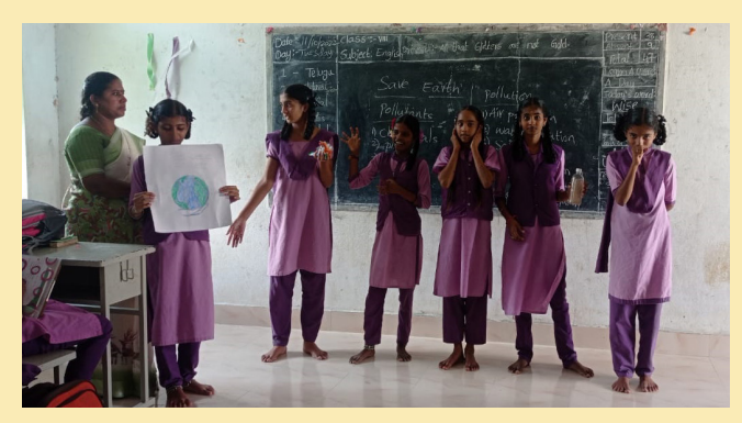
An educator conducting a group activity on "If a tree could talk; Save Earth by planting trees, not cutting them" - APNGC ECHO program