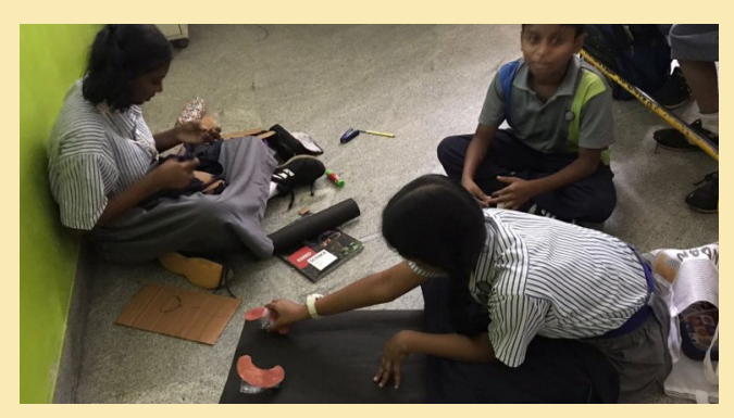
Grade 7 students from Balsam Academy, Tamil Nadu demonstrated the working of the Urinary system in humans and the role of the Kidney as a filtering system- thiMk Re-imagine Science ECHO